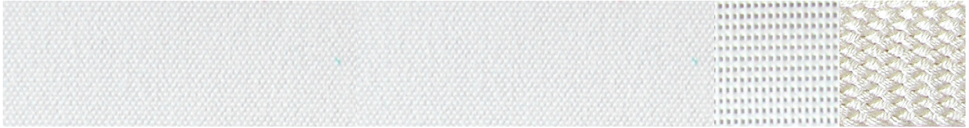
Sattler 321-010 white