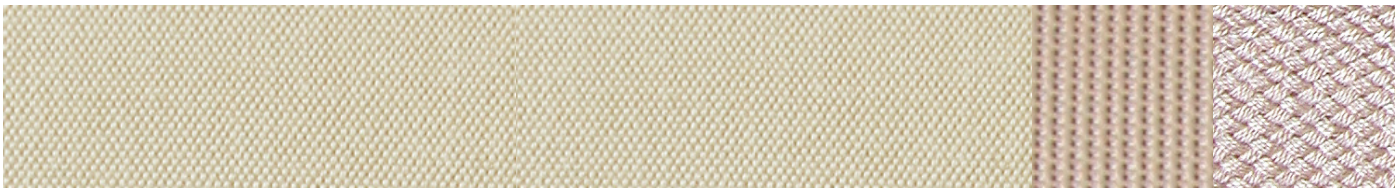
Sattler 321-325 sand