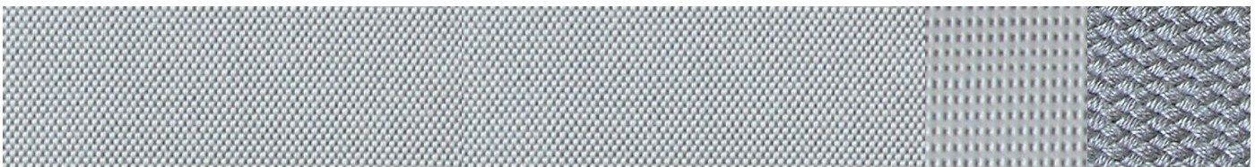
Sattler 321-030 light grey